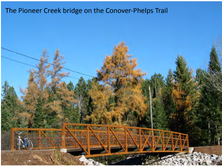
The Pioneer Creek bridge on the Conover-Phelps Trail